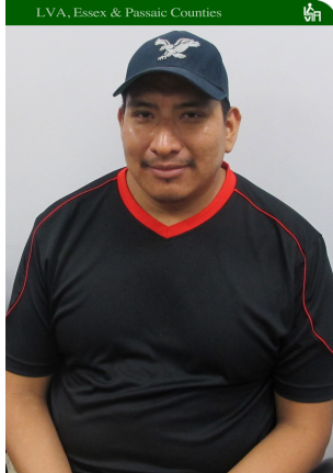
Literacy Volunteers of America, Essex & Passaic Counties