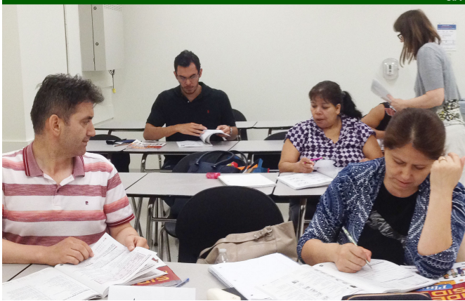
Literacy Volunteers of America, Essex & Passaic Counties