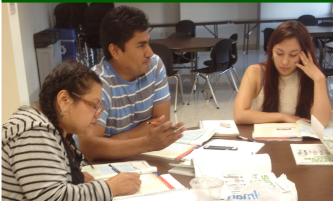
Literacy Volunteers of America, Essex & Passaic Counties