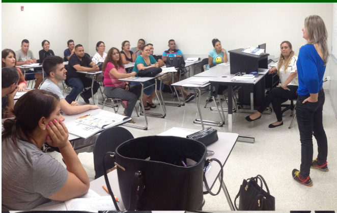
Literacy Volunteers of America, Essex & Passaic Counties